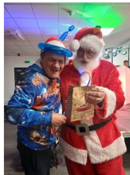
A happy resident gets a present from Santa at Timber Lodge