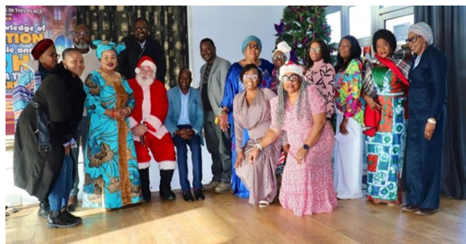
and the congregation at the Prophetic Voice Tabernacle are happy to see Santa again.