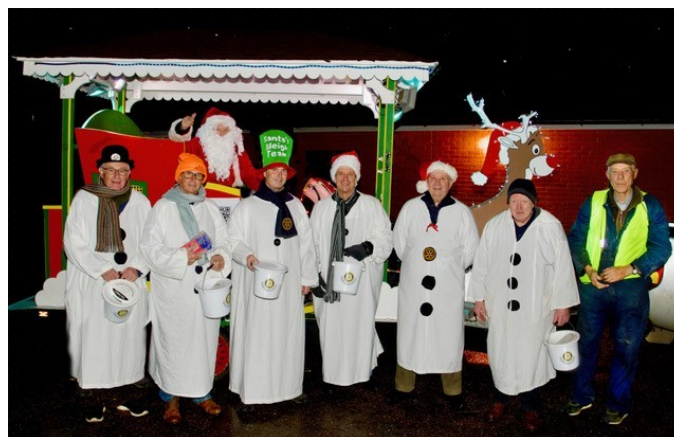
The photo shows Santa and his Snowmen preparing to start their street collections in Rochford.