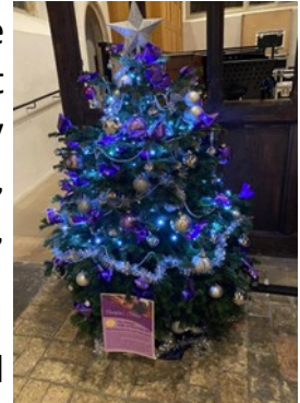
Rayleigh Mill Rotary's Christmas Tree supporting the Purple 4 Polio campaign.