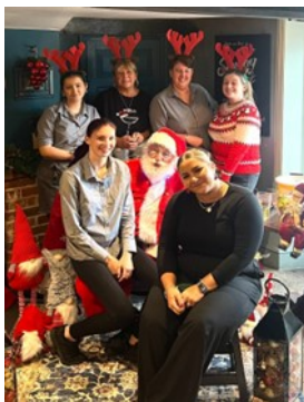
The staff at the Bull get into the Christmas Spirit