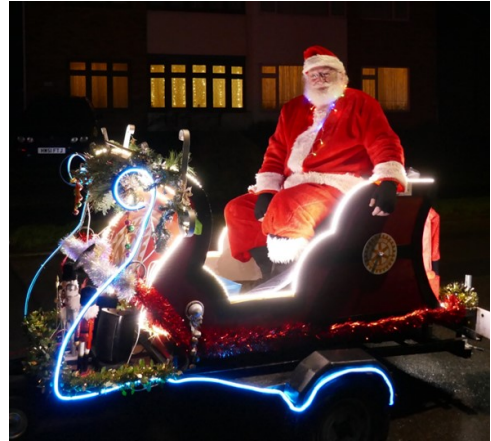
Santa ready to meet his many admirers

This year the members persuaded Santa to do more runs to meet even more children to spread the excitement of Christmas.