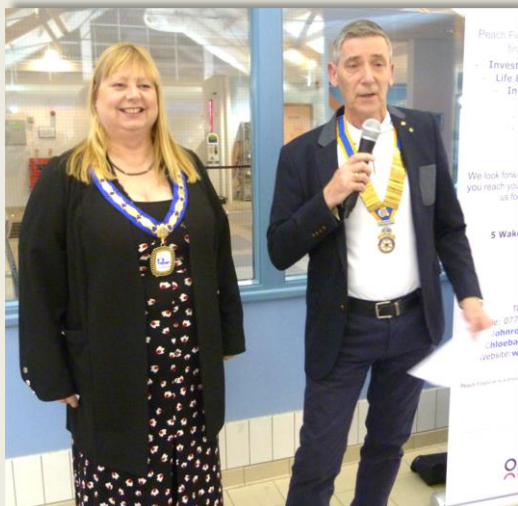
The opening speeches