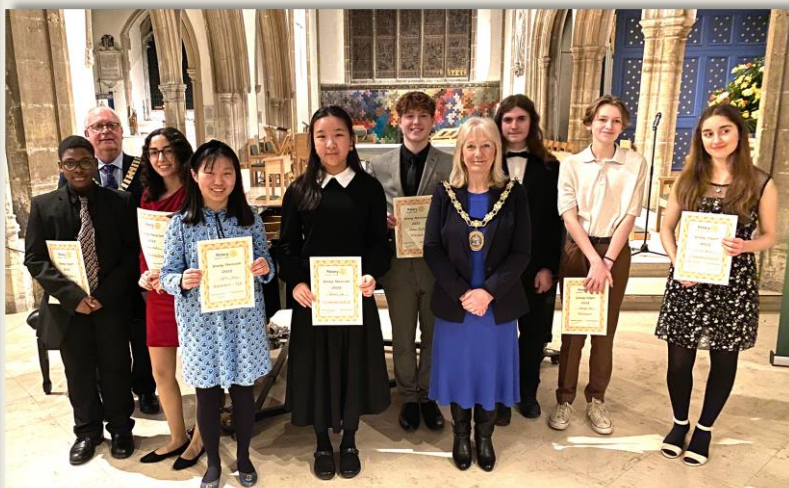
All of the entrants lined up with the Mayor and District Governor.