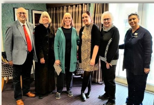
Rotary visitors and staff at Derham House