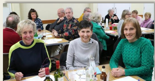
Just a few of the participants at Mayflower's quiz night recently.