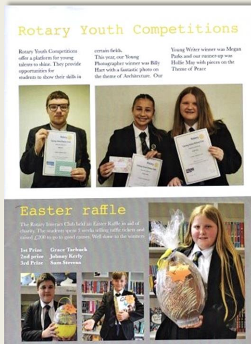
A page from the Cornelius Vermuyden School Spring news magazine