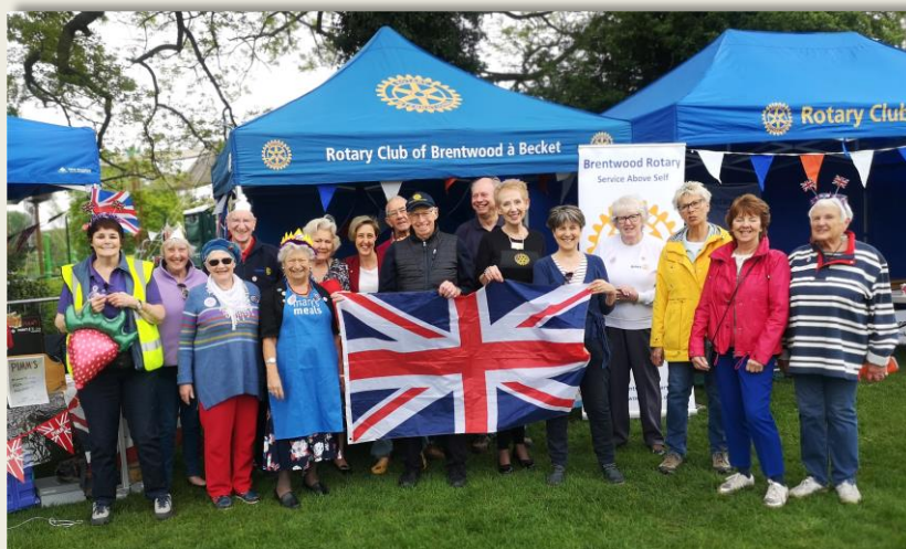
The Rotary Village

The event was arranged by Brentwood Council and exceeded their expectations in every way. Adults visiting the Rotary Village had the opportunity to purchase a glass of fabulous Pimm's, or Prosecco (Shenfield Rotary), to take part in a