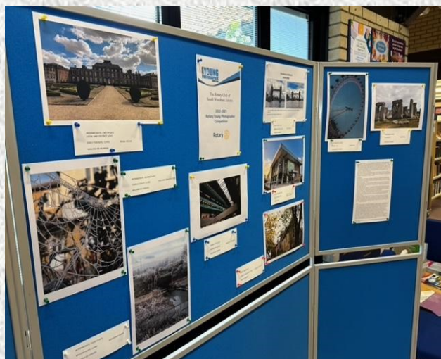
PHOTO COMPETITION SUCCESS

The second photograph competition organised by our Youth Committee has been a resounding success. The theme this year was " The Beauty of Architecture ". Entries were forthcoming in three age categories and all were put on display in the Library. The standard of entries was excellent and the judge had his work cut out to identify the winners and congratulated everyone on their efforts.