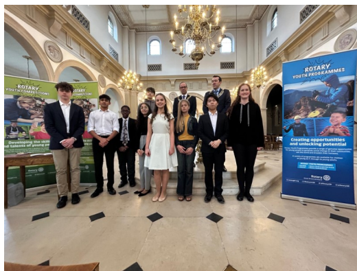
The Competitors with the District Governor and Mayor of Brentwood